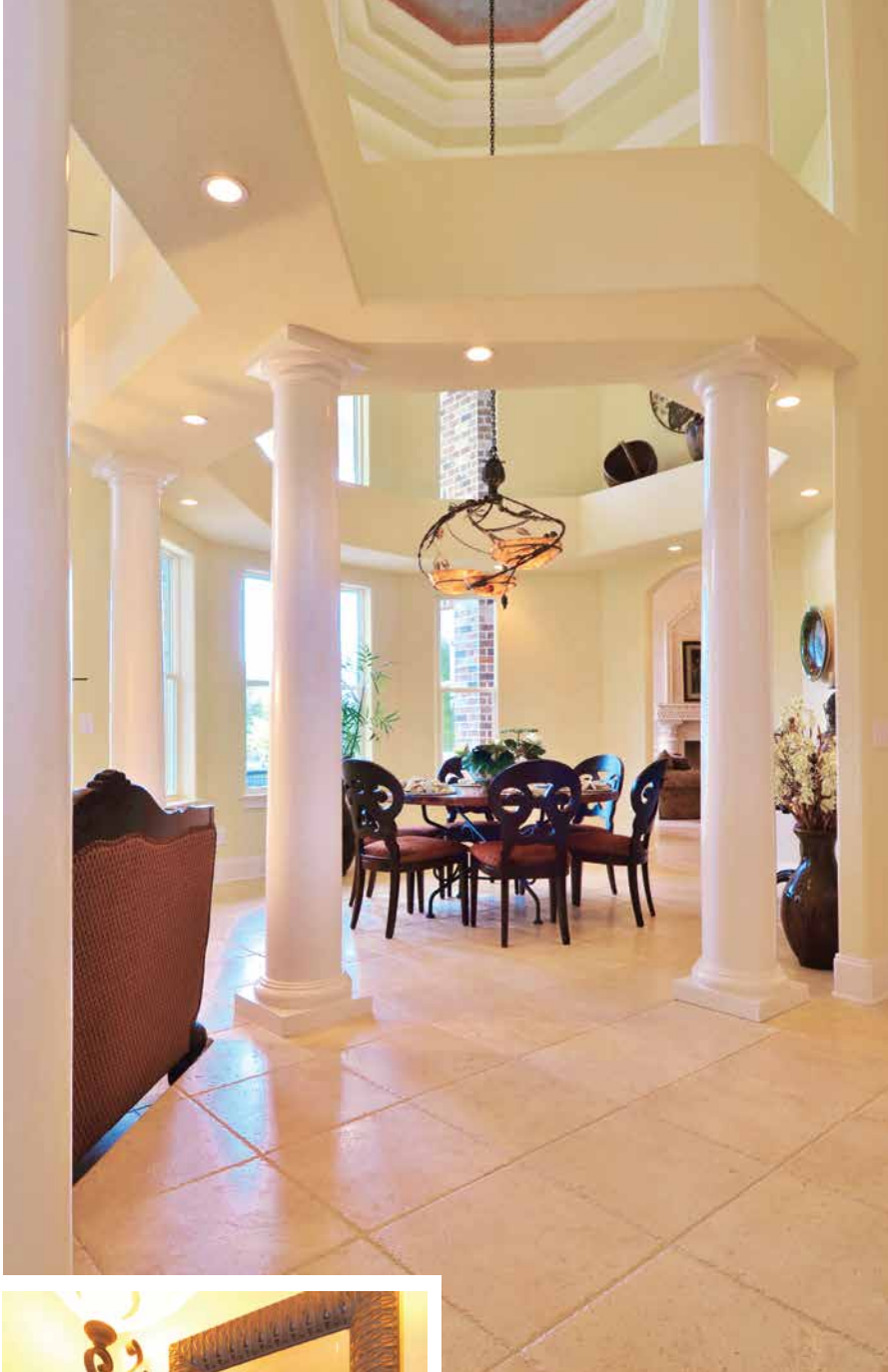
Above: The Comeaus' formal dining room displays lovely travertine stone floors and a flowing, handmade glass chandelier.