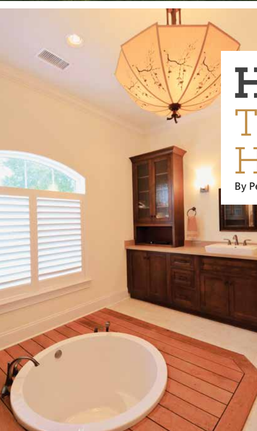
A gorgeous Japanese soaking tub with teak surround, highlighted by an ornamental Japanese parasol chandelier in the Cramers' master bathroom